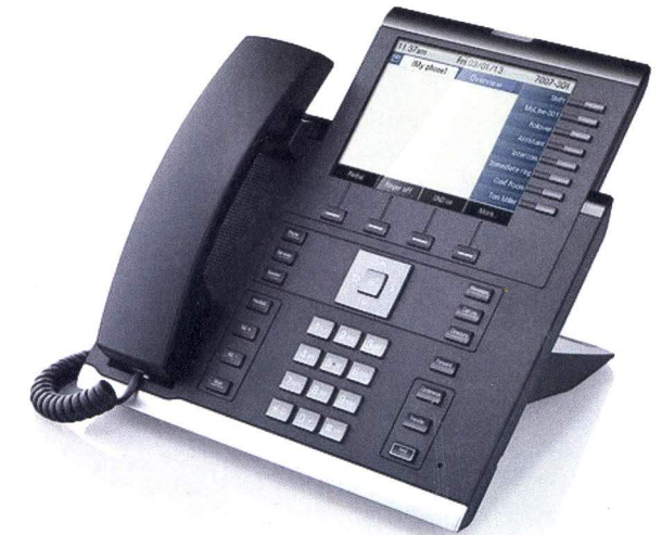
VoIP Desk Phone IP 55G